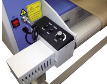
Motorized rear rewind for roll-to-roll applications