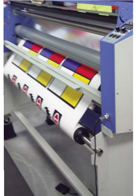
Fewer film changes with 300' rolls.