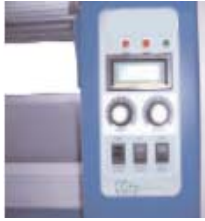
Simple speed and temperature controls

The 563THMAXPRO will boost productivity by over 50%.