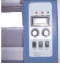
Simple speed and temperature controls

The 563THMAXPRO will boost productivity by over 50%.